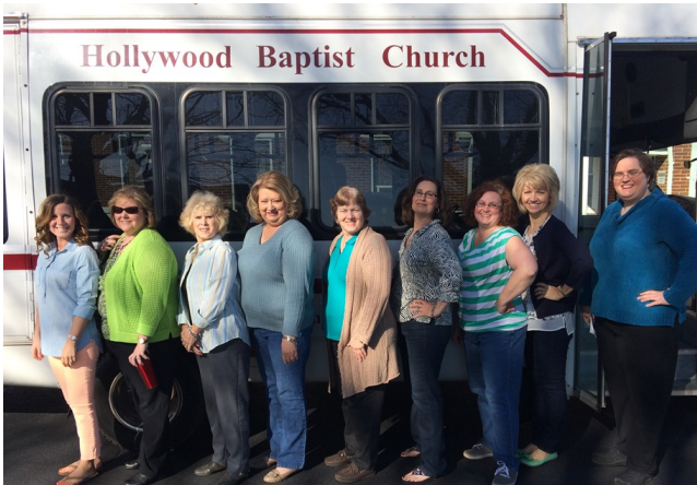
2016 Prayer Advance Attendees