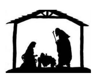
The Mission of the Manger

Congratulations Hollywood! We greatly exceeded our pledge of $13,350.00, for 2021 and donated $18,308.85 to world missions. As a church, you have set a pledge goal of $14,965.00, for the 2022 Lottie Moon Christmas Offering. As of January 30, 2022 we have collected $1,758.80.