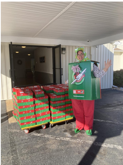
Sally Shoebox was delivered safely to the drop off location along with 451 of her brothers and sisters. Next stop the processing center!

Samaritan's Purse distributes Operation Christmas Child shoeboxes to children across the world as a way to get the Gospel to children in more than 170 countries who might otherwise never hear the name of Jesus.